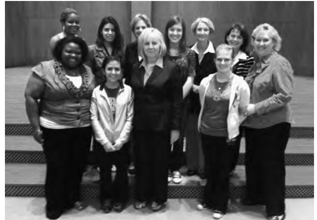
Attendees of the first WOW session.