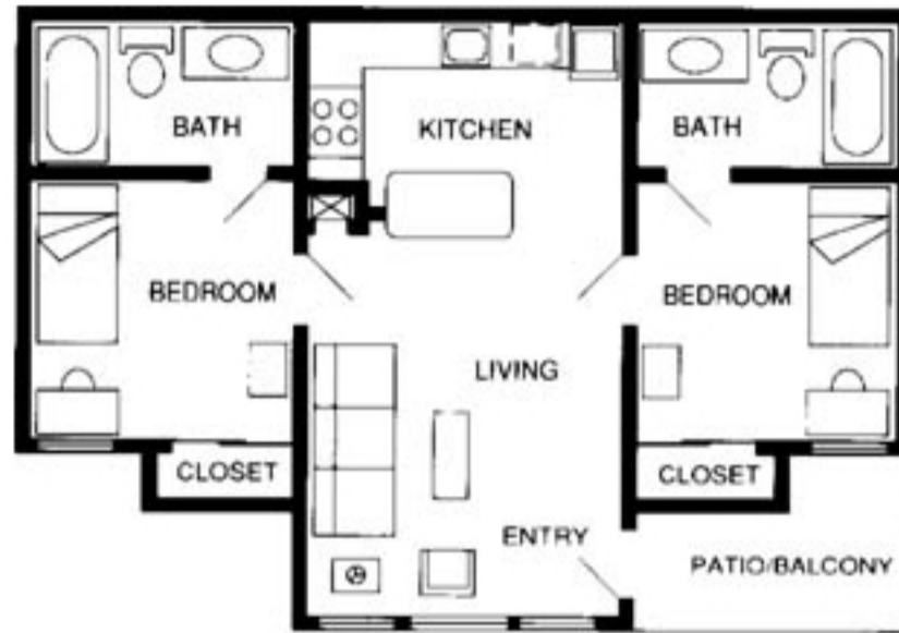
2 Bedroom Unfurnished 610 Square Feet