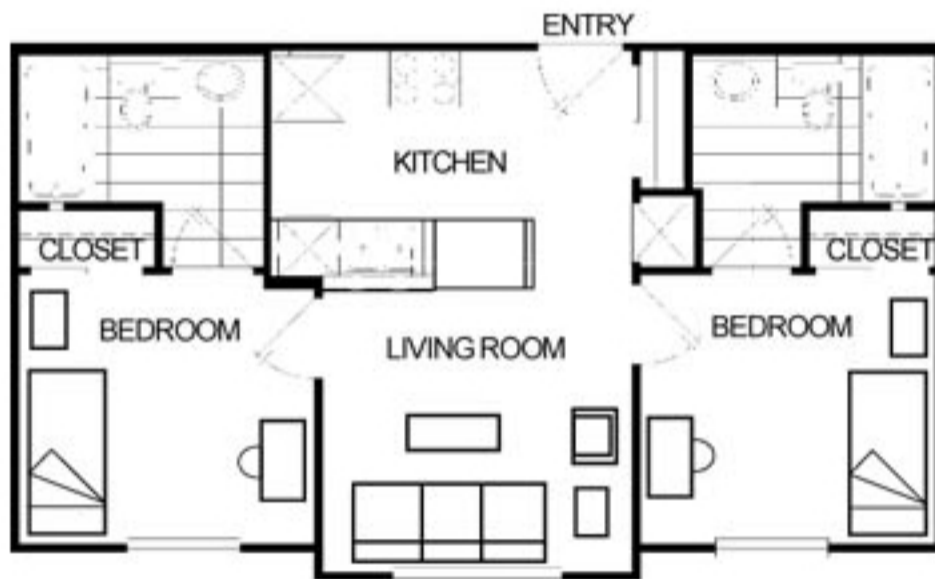
2 Bedroom Furnished 610 Square Feet