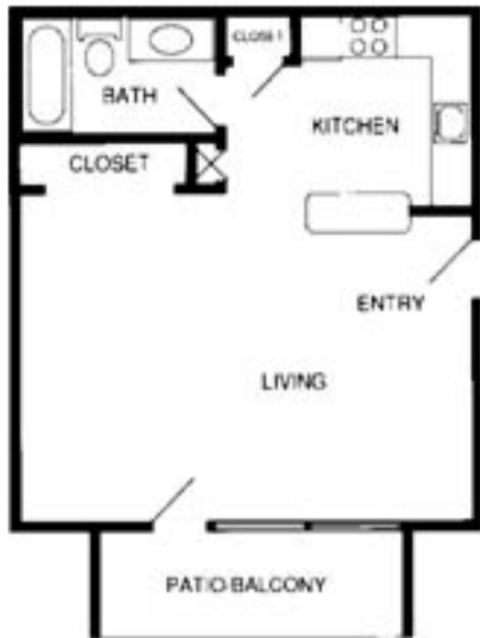
Efficiency Unfurnished 495 Square Feet